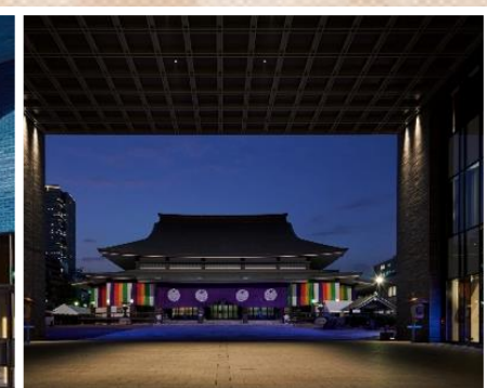
Namba Betsuin, Osaka, Japan