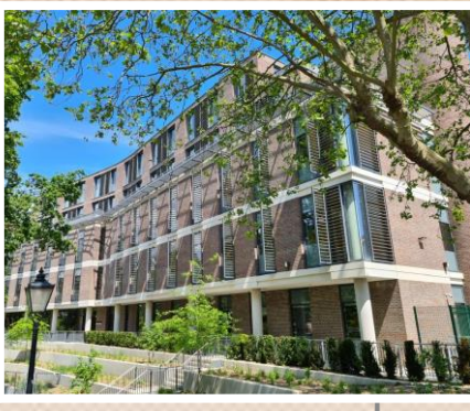
Pears Building, London