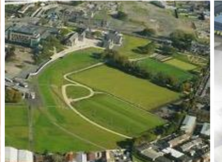
Grangegorman, Dublin, Ireland

Global awards celebrating excellence in alliance