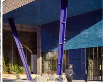
100 Union Street, London, England